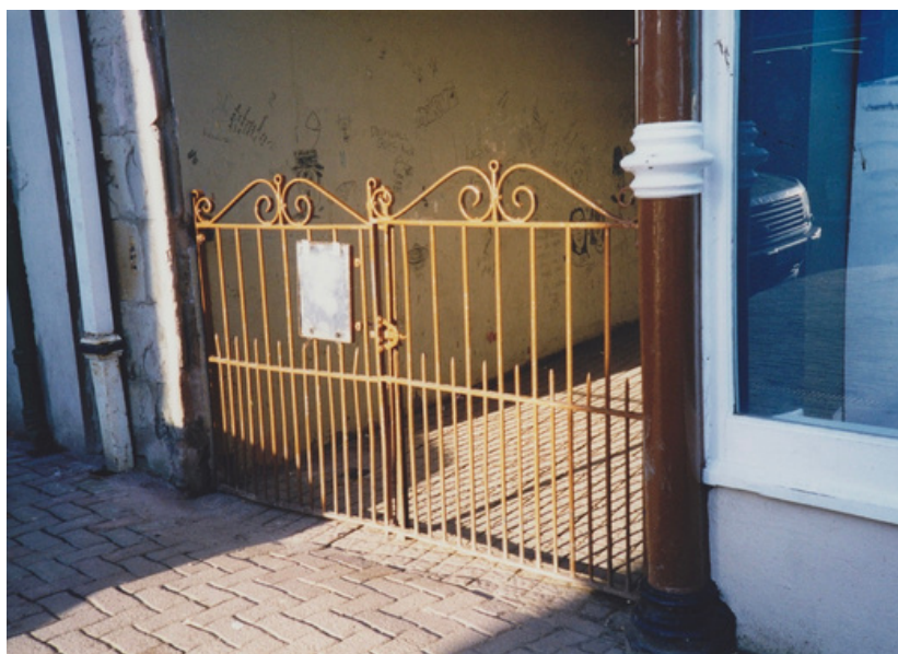
Above: Eagle Court before Below: opening ceremony