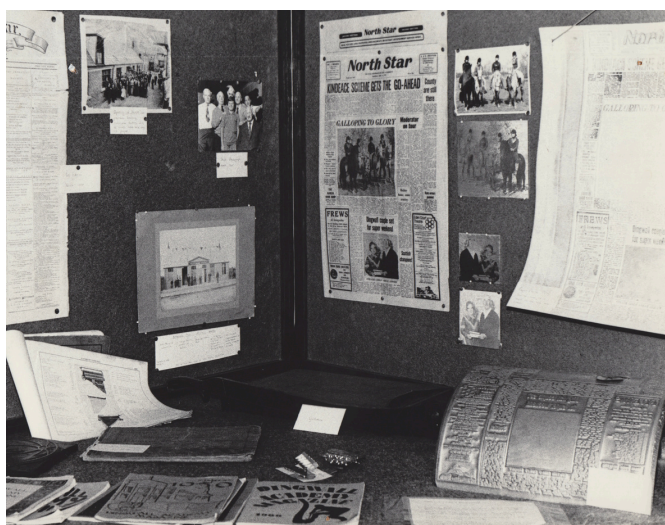
The Press Room