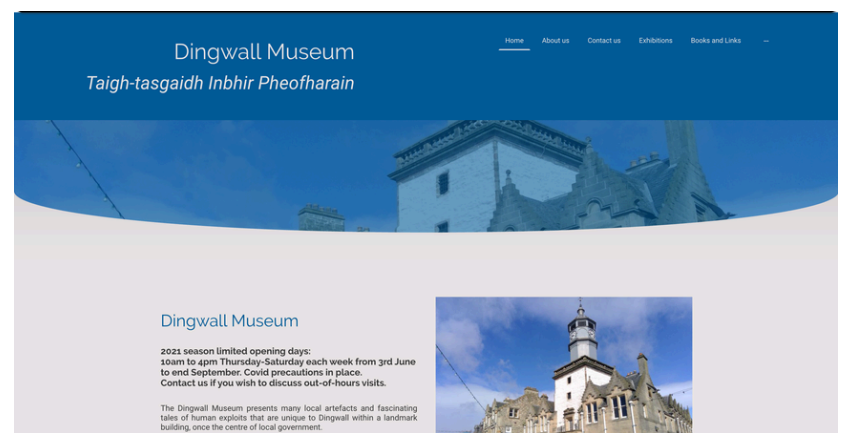
Old museum website as it was in 2021

During the 21st Century, the world has become much more digital, and the Museum Trust has followed suit. The museum digitised its records of the items in its collection which had previously been on paper. This shift can also be seen in the way the museum handled enquiries. In the year 2000, it is recorded that "316 items – mainly photographs – were acquired; 273 items of mail despatched", while in 2009, 546 enquiries were answered by phone or email. In 2012, the Museum Trust began work to create their own website.