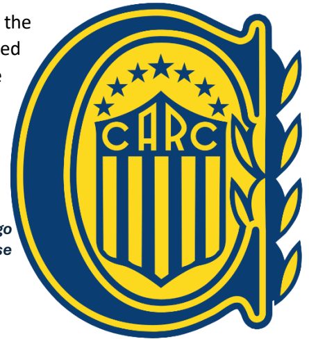
Rosario Central's Club Logo © club atletico rosario central escudo/ Fair use

The story of Colin's chairmanship of Rosario Central from 1889 to 1900, the development of its fierce intra-city rivalry with Newell's Old Boys (a team founded by an English school teacher), and its many successes in the upper levels of the Argentinian league, is well-known in Argentina. But it leaves open the question – what did Colin bring with him from the Highlands of Scotland to the city of Rosario? What do we know about the younger Colin Bain Calder's days in Dingwall?