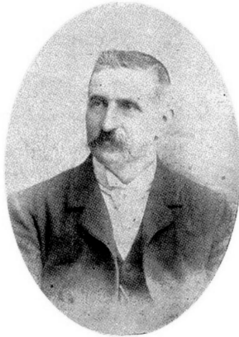
Colin Bain Calder © public domain