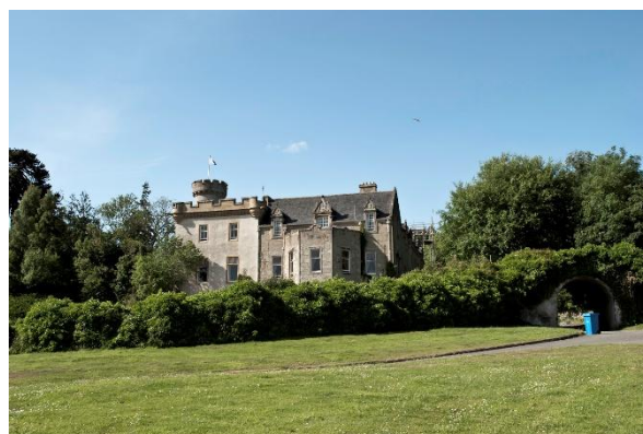
Tulloch Castle

During the summer months, he turned out for the Dingwall Cricket Club – which played its matches in the grounds of either Tulloch Castle or Castle Leod. At Tulloch in June 1880, in a friendly match against visiting officers of the Highland Light Infantry, he was reported as 'batting with his usual coolness' and becoming the top scorer with 18 runs.