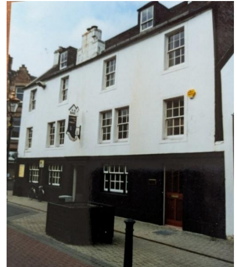
The Caledonian Hotel